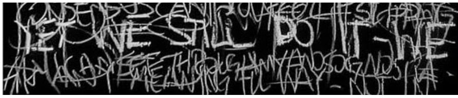
Species Anosognosia, 2019 oil stick on canvas 88.5 x 62.25 in 225 x 158.1 cm